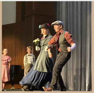
CELA SPRING MUSICAL