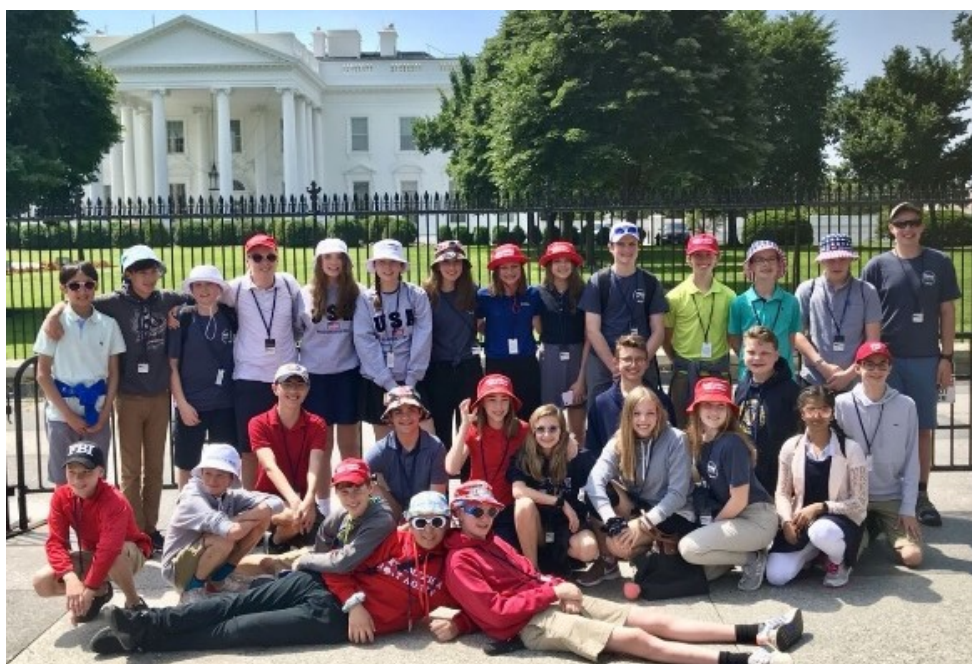
ANNUAL 8 TH GRADE TRIP TO WASHINGTON D.C.

HERE ARE EXCERPTS OF GRADUATION SPEECHES THAT WERE PRESENTED ON THURSDAY, JUNE 6 TH BY FOUR OF THE GRADUATES. YOU CAN LEARN MORE ABOUT CELA AND READ THE FULL SPEECHES AT CELAEDU.ORG !